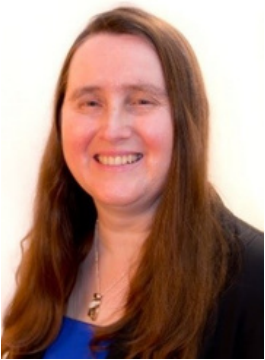
FB Representative (acclaimed)